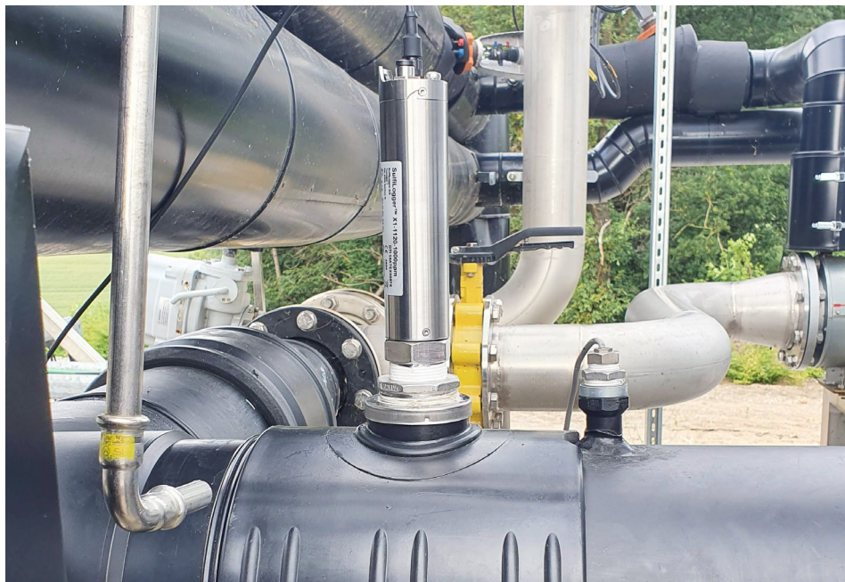
The SulfiLogger™ H 2 S sensor at Haerup Biogas. It measures in-pipe right after the biofilter.

After implementing the SulfiLogger™ H 2 S sensor, Haerup Biogas experienced several benefits related to CHP engine efficiency and protection.