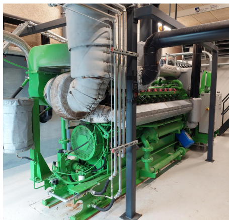
CHP engine unit at Haerup Biogas.

To enhance the efficiency of their CHP engines, Haerup Biogas, a Danish biogas plant, recognized the limitations of their existing H 2 S monitoring system. The existing setup relied on a traditional multi-gas analyzer, which required drying samples before measurements, leading to operational complications.